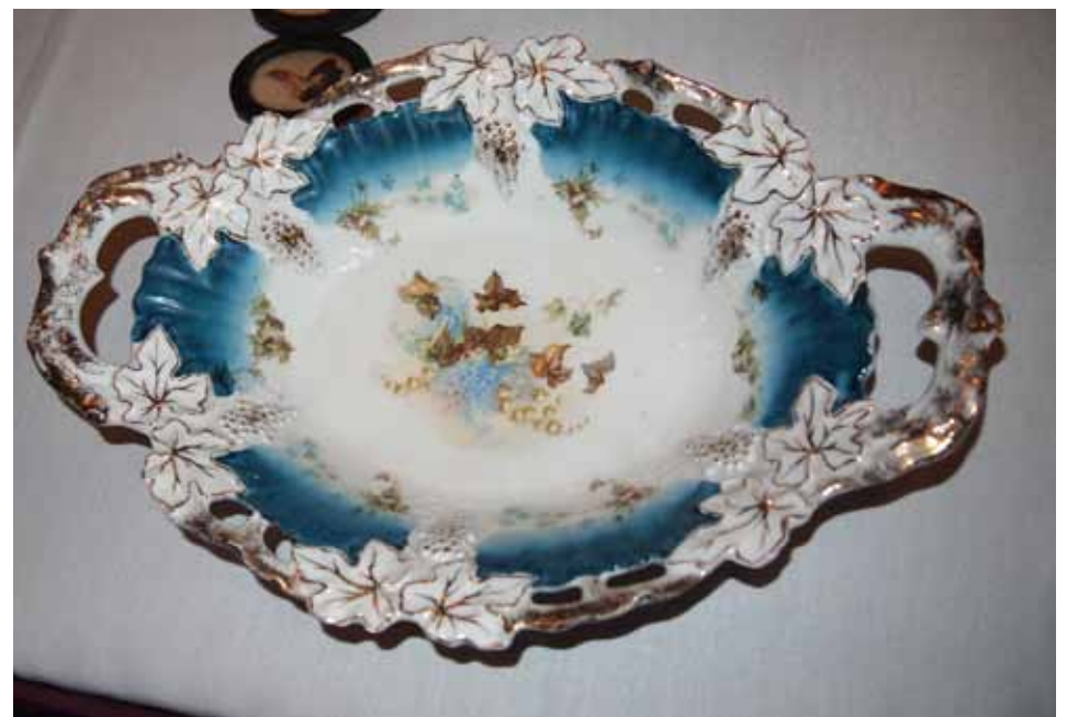
International Association of R.S. Prussia Collectors, Inc. | October 2013 | 13